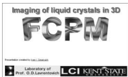
Figure 1. Splash screen: Fluorescent confocal polarizing microscopy (Liquid Crystal Institute, Kent, OH).

At the International Liquid Crystal Conference held in Edinburgh, Scotland, June 30 to July 5, Ivan Smalyukh was awarded the International Liquid Crystal Society's (ILCS) 2002 Multimedia Prize for his stimulating web tutorial with interactive graphics on the uses of fluorescent confocal polarizing microscopy (FCPM) for 3D imaging of the liquid crystal director field (Figure 1).